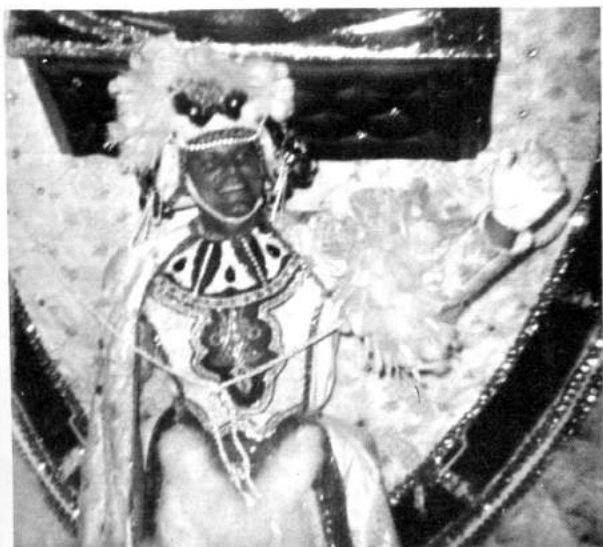
Handsome String Band Leader