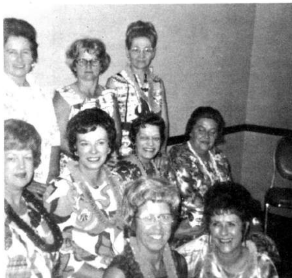
Warren Ladies Luau Night.