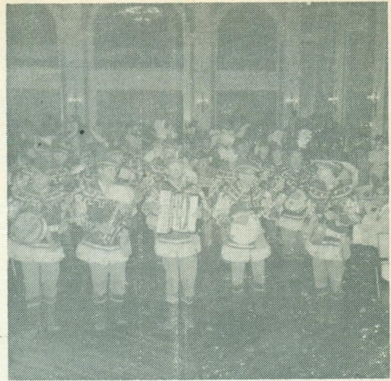
Quaker City String Band