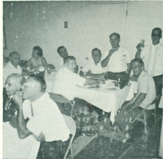
Tour of Brewery at Reunion