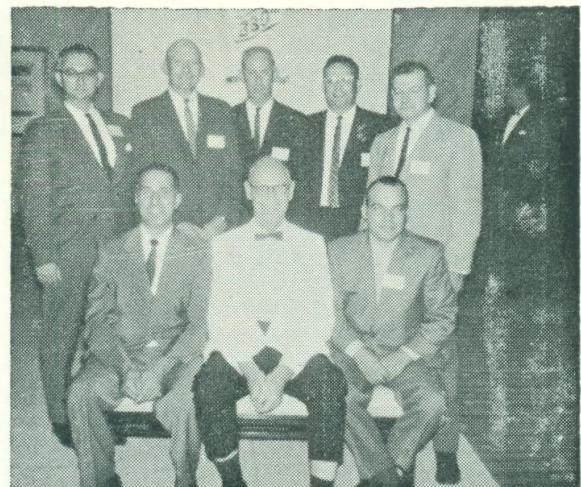
Group of 330th Members at Reunion