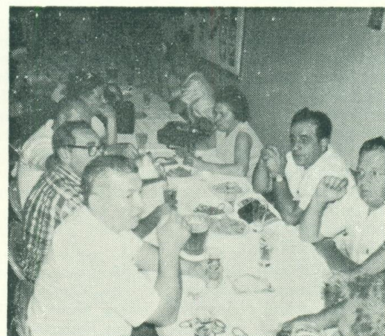
Tour of Brewery at Reunion