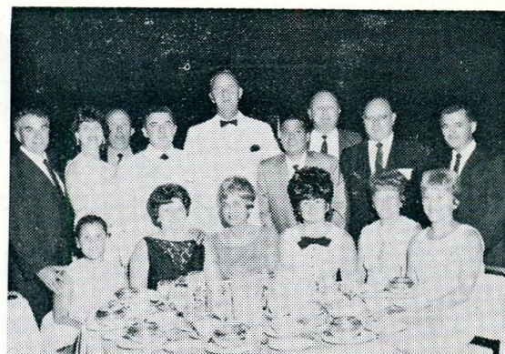
Part of Philadelphia Chapter Group taken at Banquet at Reunion in Pittsburgh