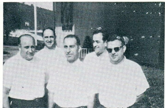
Boston Chapter Members at Reunion