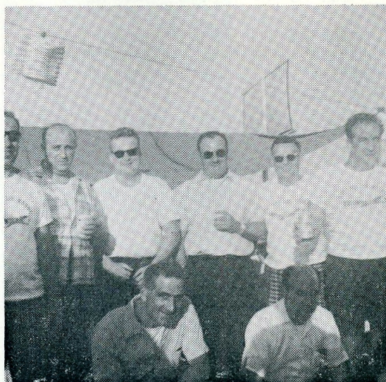
Drinking Time at Chuck's Place