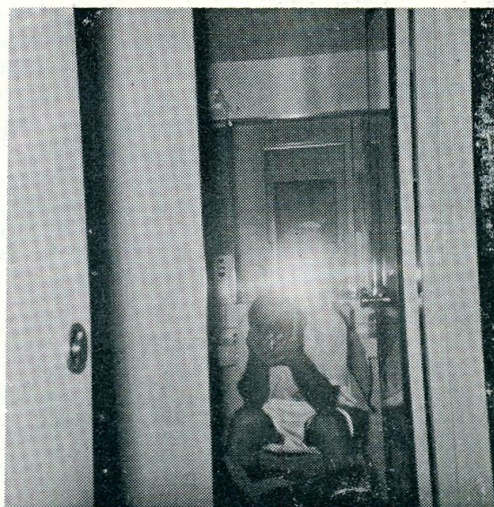
Guess Who? Taken in the Pittsburgh Hilton Hotel