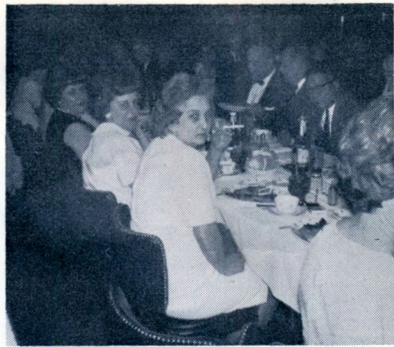
Chateau Supper Club 83rd Men's Club Anniversary.