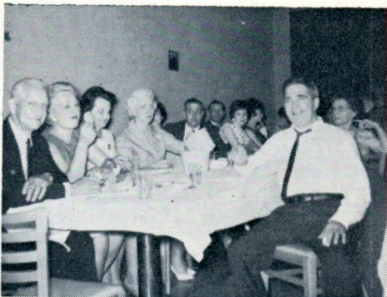
Part of the group attending Pittsburgh Banquet.