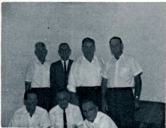
Part of Co. F-329 taken at their C.P. in Myrtle Beach.

That's about all. Let's all get in there and "Charge".