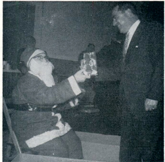
A little gift from Santa.