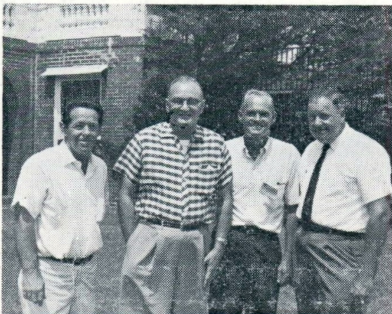
Part of the gang from Co. F-329 in front of Ocean Forest Hotel.