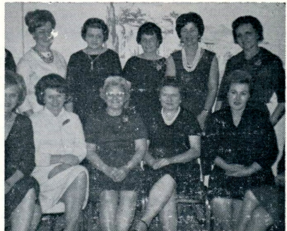
Our gals of the Cleveland Chapter.