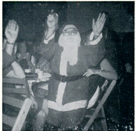
A Jolly Santa