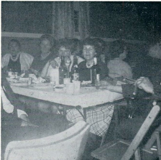
Some of the happy gals.