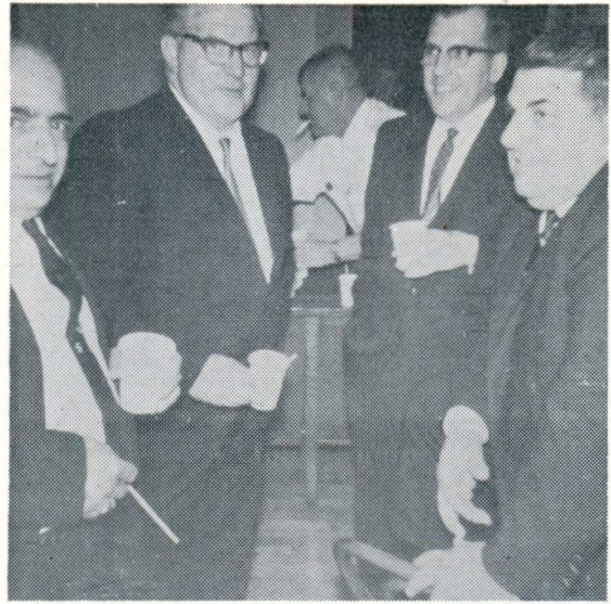
We just can't remember all those boys.

DUES ARE NOW DUE PLEASE SEND IT IN IMMEDIATELY.