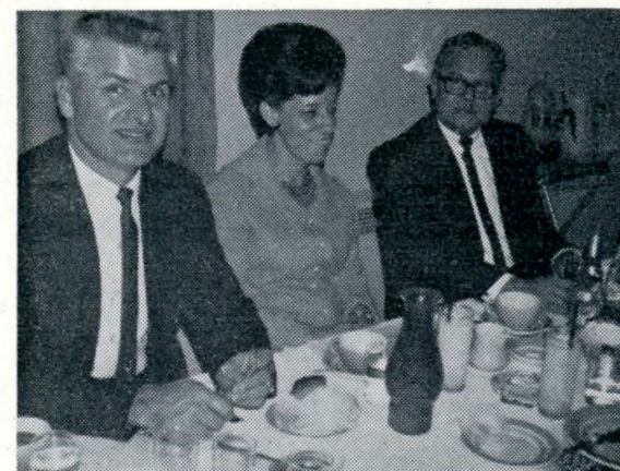
The gang from the Hoosier State (Ed. note: Must have been quite a party with all those smiling faces.)