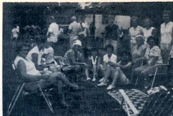
Something was funny