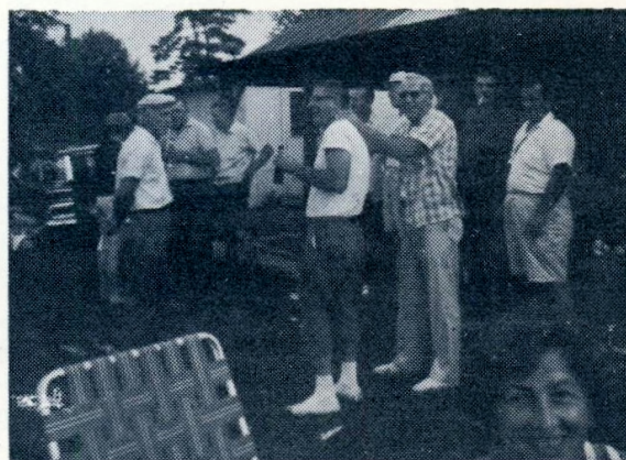
Just a plain old gab fest