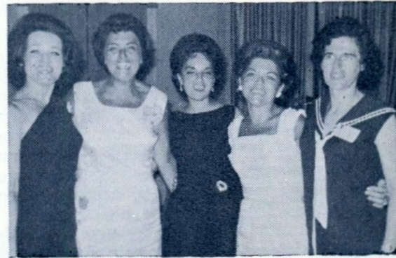
Bring on your Miss America.