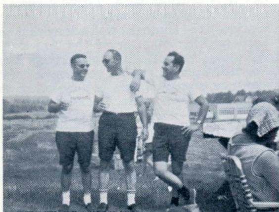
Excuse me, gentlemen, your knees are showing.