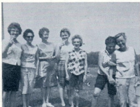
Seven well fed gals and each one smiling.

The Boston Chapter's macaroni and meat ball supper was well attended.