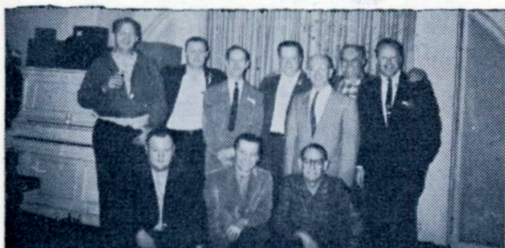
The gang from the Chicago Chapter.

A tough Army 1st Sergeant was talking to one of his Privates 1st Class, who was about to be discharged: "I suppose when you get out of the army you will be waiting for me to die so you can spit on my grave." Replied the private, "No, Sarge, after I take off this uniform I don't want to ever stand in line again."