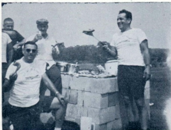
The food was good, the drink plentiful and the day, delightful.