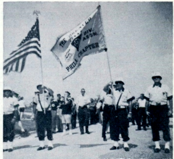
Colors and Guard, Compliments of Philadelphia Chapter