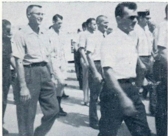
A grand time was had by all.