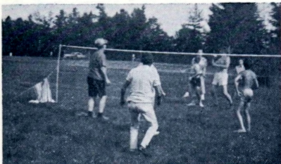
Hot Volley Ball Game.