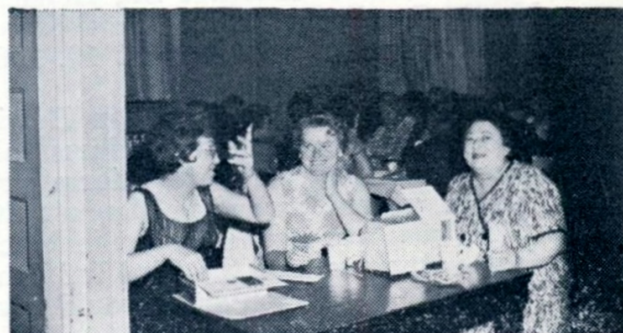
Taking care of the loot.