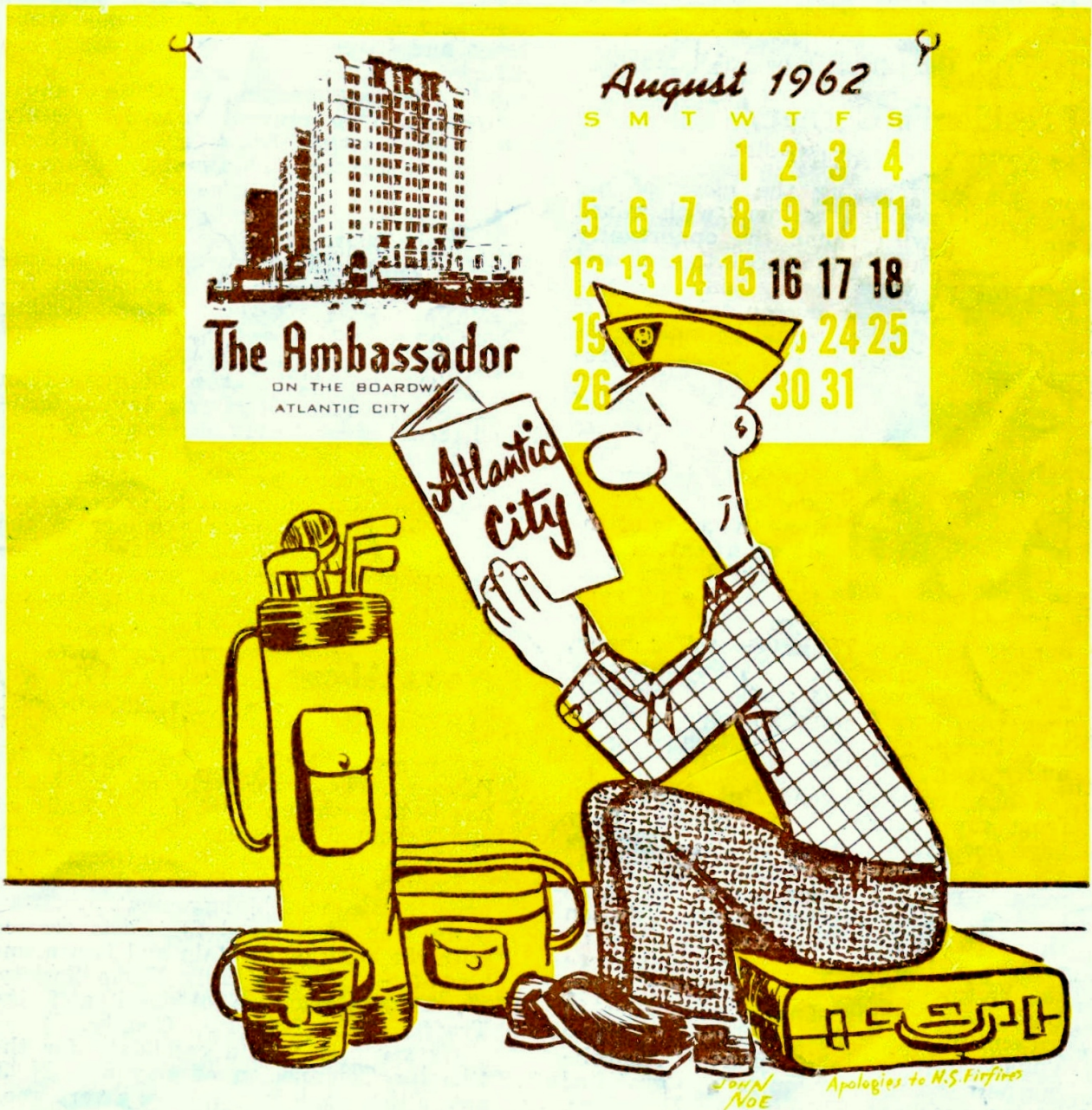
Cover Cut