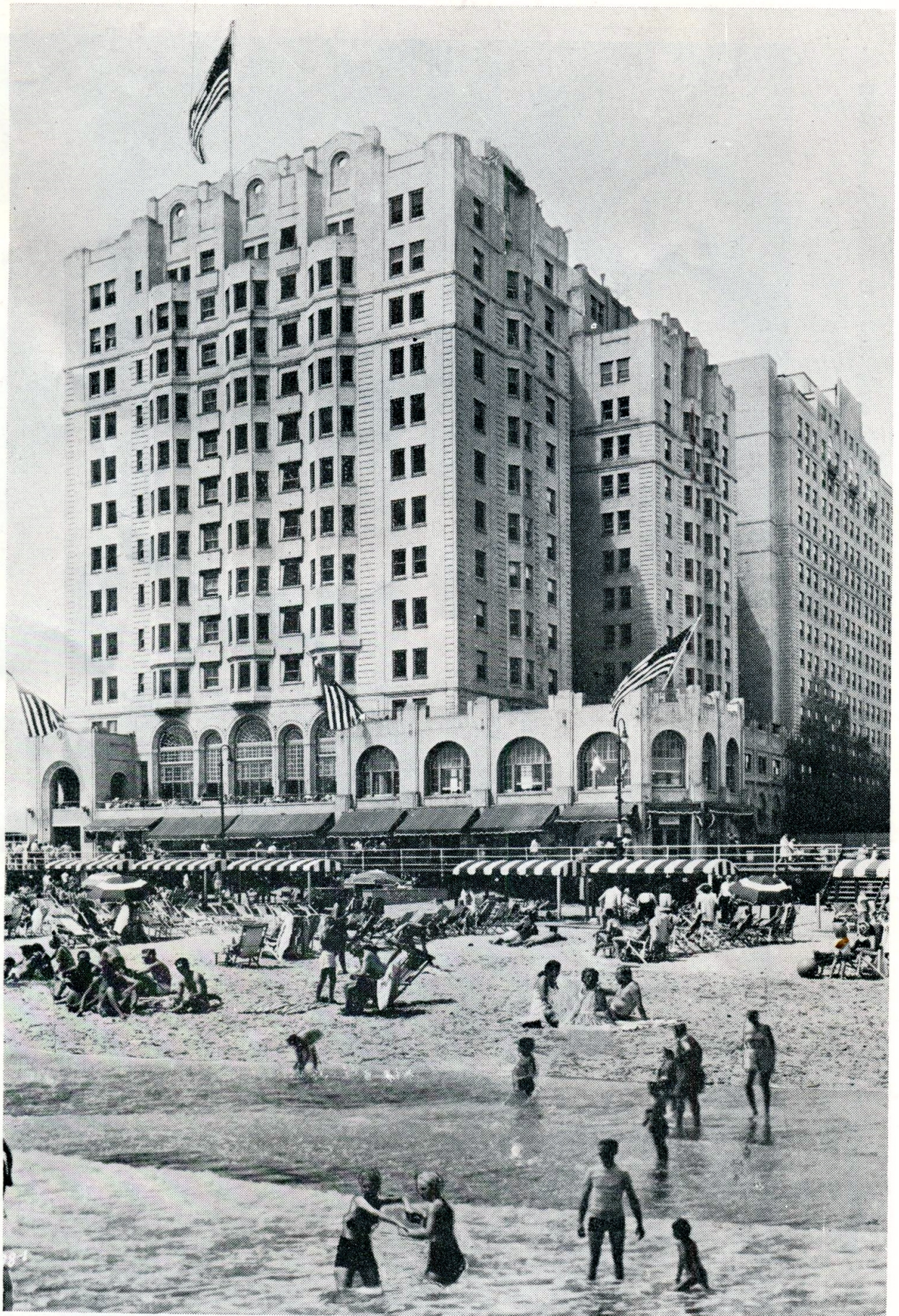
HOTEL AMBASSADOR, Atlantic City, New Jersey