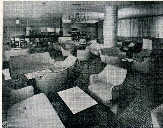
BAR and LOUNGE