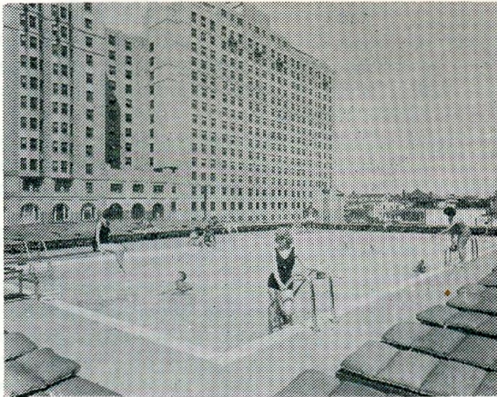
AMBASSADOR OUTDOOR POOL