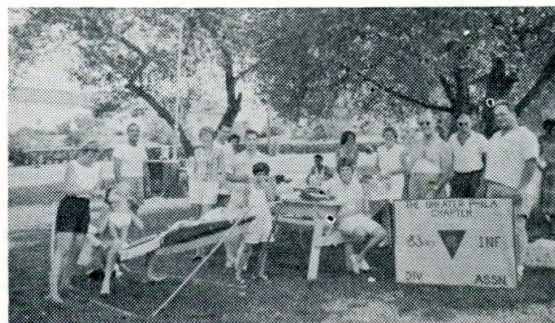
Big doings at the Paulino Estate.