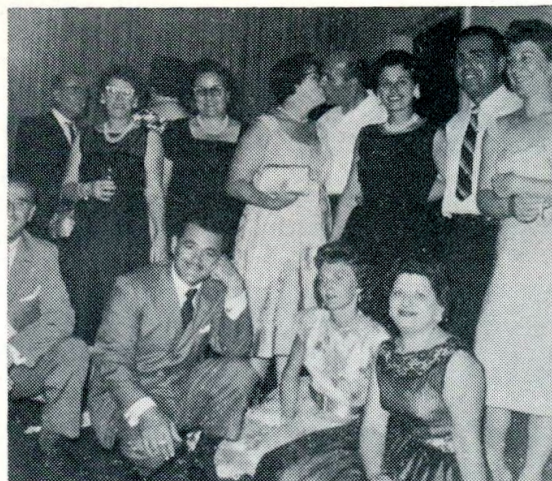
That happy Philly crowd.