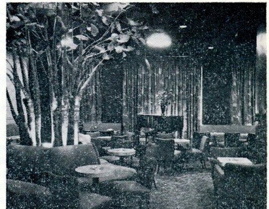
Purple Tree - Lounge Bar