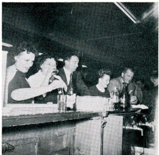
With Some of Their Ladies.