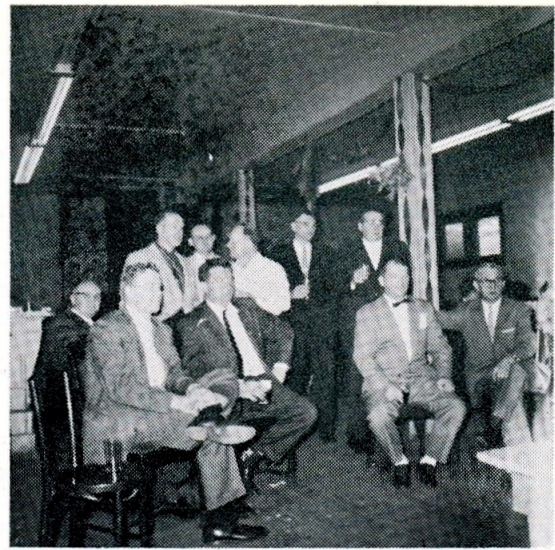
The Cleveland Gang—Christmas Party