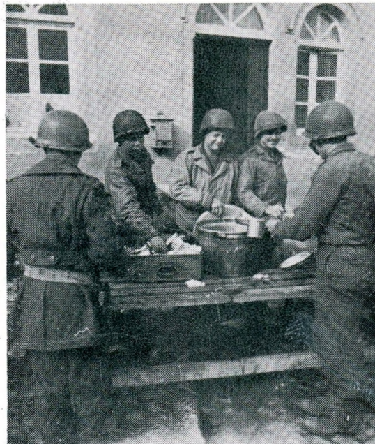
Chow Line—Hq. 3rd Bn. 330

time after time. If something is wrong please let us know. I'm sure it can be straightened out. Let's see if we can't get back in the swing of things, we're all friends, let's all be buddies.