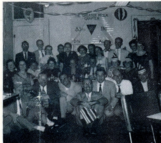
Pictured above are some of the members, and their guests, of the Greater Philadelphia Chapter at their annual Christmas Party.