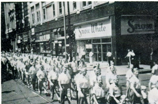
BELOW — "OLD SOLDIERS" ON THE MARCH AGAIN.