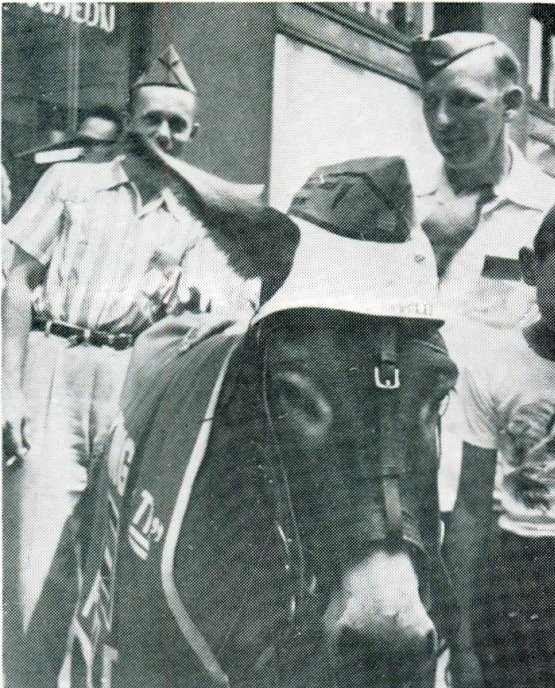
ABOVE — THREE "OLD SOLDIERS" GET READY TO PARADE.

And so another reunion is put to bed. For those who attended, the memory of the splendid time will act as a spur to participate in all future reunions. For our buddies that couldn't make it, we hope that your plans materialize and you can make the next one. It's not too early to make your plans to be in Washington, D. C., in 1956. The annual reunion of all "Thunderbolts" serves as a beacon to beckon all former 83rd buddies, to convene and meet your former companions. Men who found friendship on the battlefield share valued memories that should never be left to die.