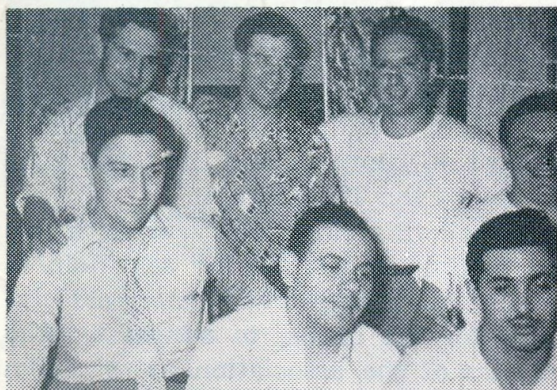
YOUR THUNDERBOLT STAFF: