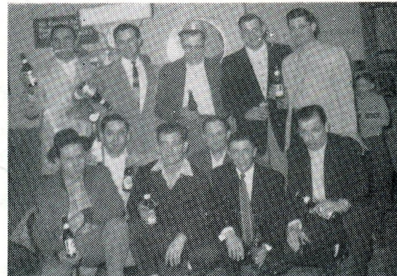
Warren Thunderbolt Bowling Champs. Any challengers?