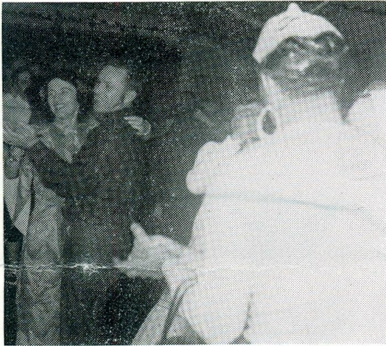
Warren Chapter Hallowe'en Dance