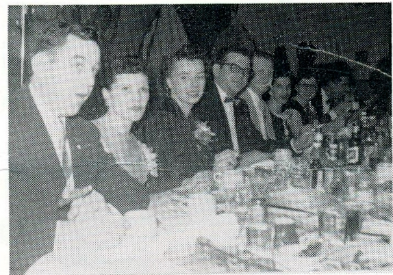
Pictured above are Warren Chapter men and wives at Annual Christmas Dinner

The Warren Junior Thunderbolts and Thunderettes came in for their share of the Christmas spoils when they were treated to a Christmas party at Club 83, that included a visit by that fine old gentlemen in the red suit and white whiskers plus the usual Christmas goodies and presents for all.