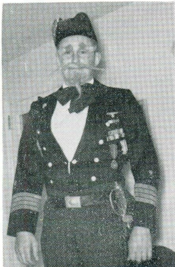
Warren Chapter Hallowe'en Dance