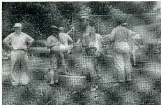
Above—Warren and Cleveland "Get-Togethers"

The Warren group also have a few ways of raising a good size treasury that helps defray reunion expenses for our members.